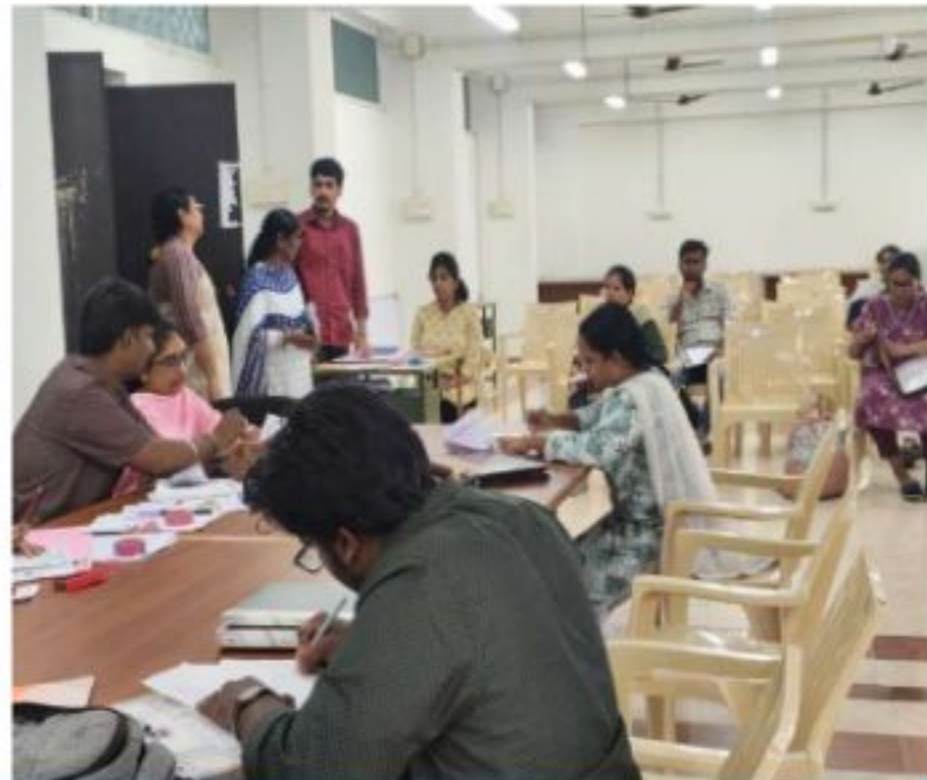
CERTIFICATE VERIFICATION CONDUCTED ON 24.11.2025 ASSISTANT SURGEON (GENERAL)