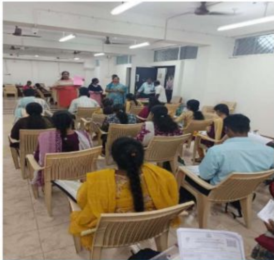
CERTIFICATE VERIFICATION CONDUCTED ON 8.9.2025 (LAB TECHNICIAN GRADE -II)