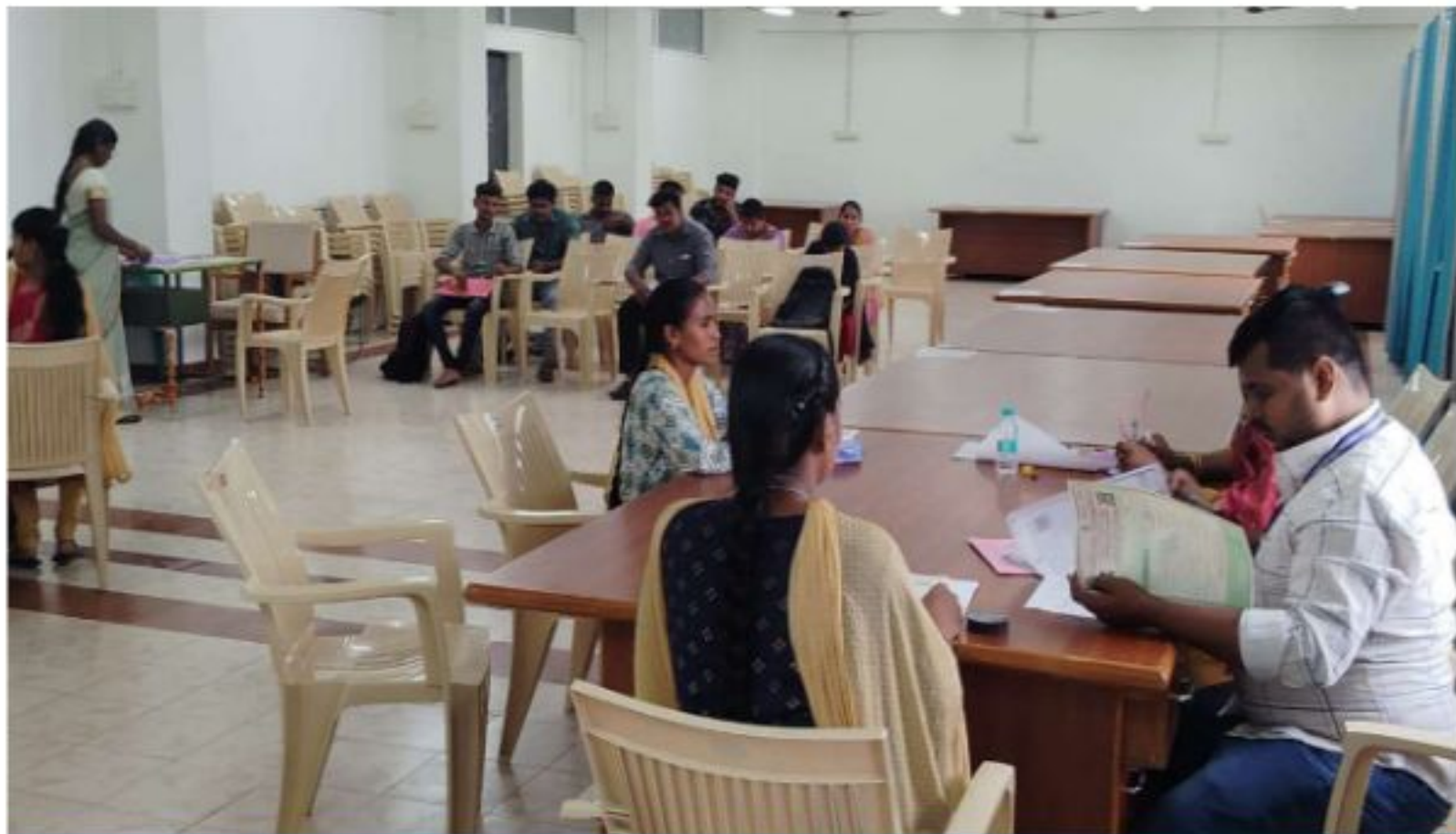
LAB TECHNICIAN GRADE – III CERTIFICATE VERIFICATION CONDUCTED ON 7.7.2025