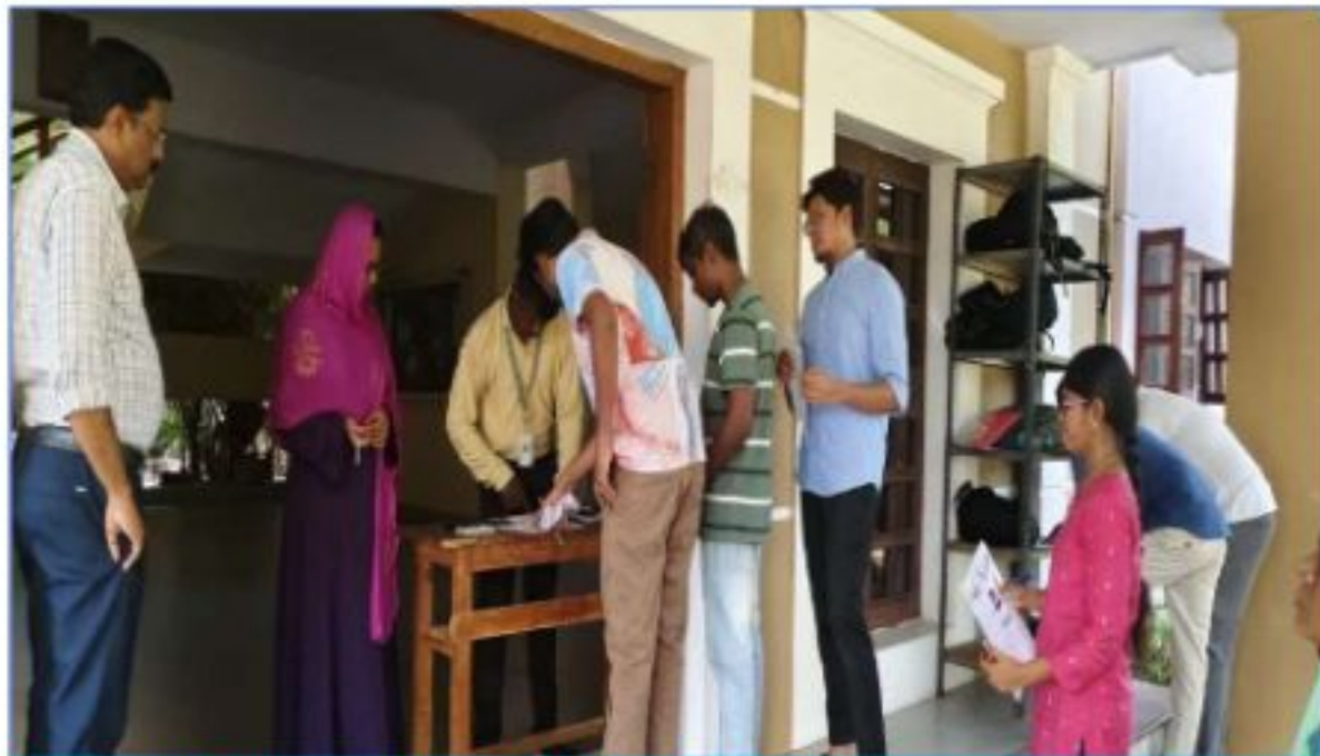
ASSISTANT SURGEON (GENERAL ) EXAMINATION CONDUCTED ON 5.1.2025 HALL TICKET VERIFICATION