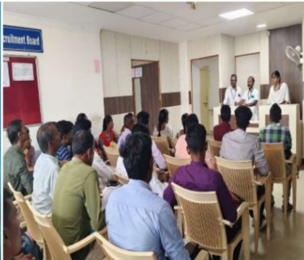
CERTIFICATE VERIFICATION CONDUCTED ON 29.8.2025 SKILLED ASSISTANT GRADE – II (FITTER GRADE – II)