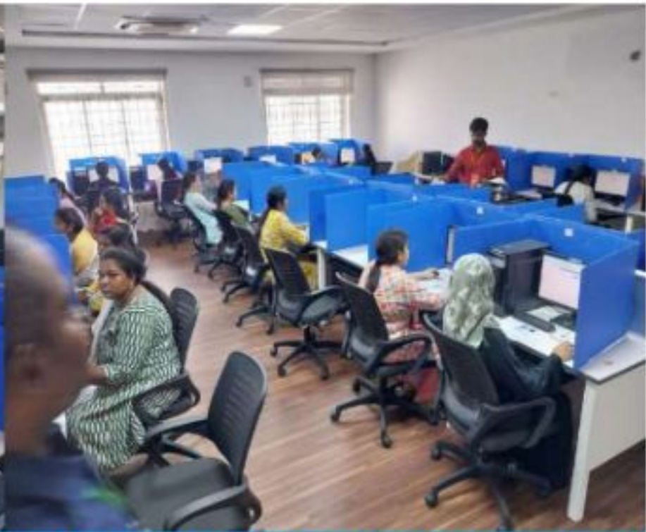
ASSISTANT MEDICAL OFFICER (AYURVEDA), ASSISTANT MEDICAL OFFICER (HOMEOPATHY) EXAMINATION CONDUCTED ON 11.10.2025