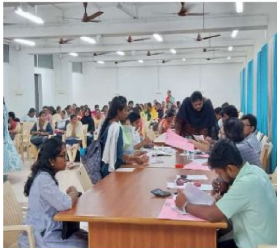
CERTIFICATE VERIFICATION CONDUCTED ON 25.11.2025 DENTAL HYGIENIST