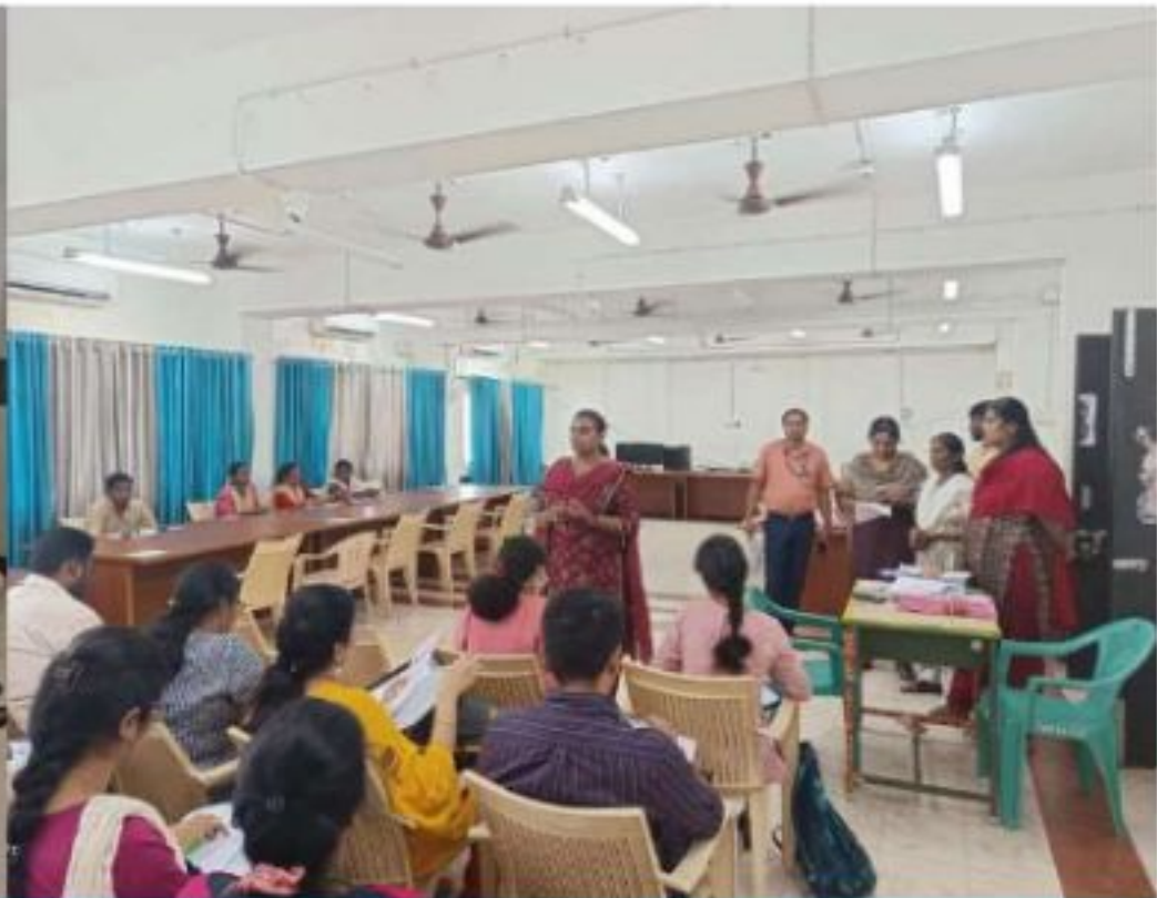
CERTIFICATE VERIFICATION CONDUCTED ON 6.8.2025 ASSISTANT SURGEON (GENERAL) – PHASE II