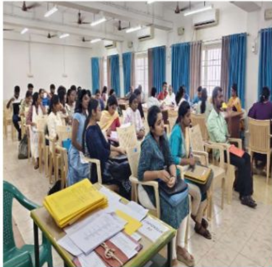
CERTIFICATE VERIFICATION CONDUCTED ON 4.8.2025 ASSISTANT SURGEON (DENTAL)