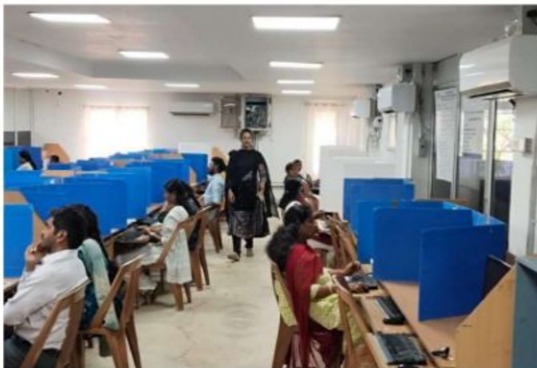
ASSISTANT SURGEON (DENTAL) EXAMINATION CONDUCTED ON 24.4.2025