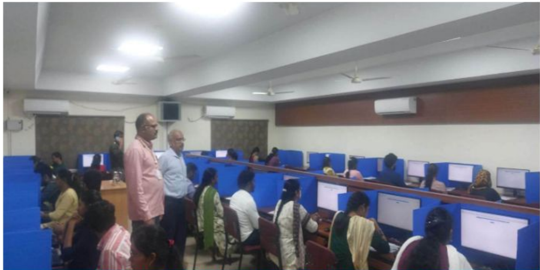
ASSISTANT MEDICAL OFFICER (SIDDHA) EXAMINATION CONDUCTED ON 23.11.2025 MONITOR OF EXAM CENTER