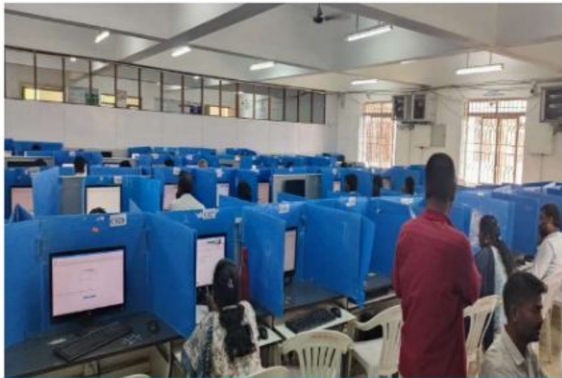
SENIOR ANALYST EXAM CONDUCTED ON 21.6.2025