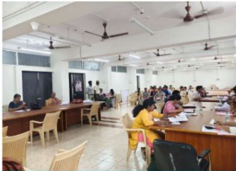
CERTIFICATE VERIFICATION CONDUCTED ON 13.11.2025 ASSISTANT MEDICAL OFFICER (AYURVEDA), ASSISTANT MEDICAL OFFICER (HOMEOPATHY)