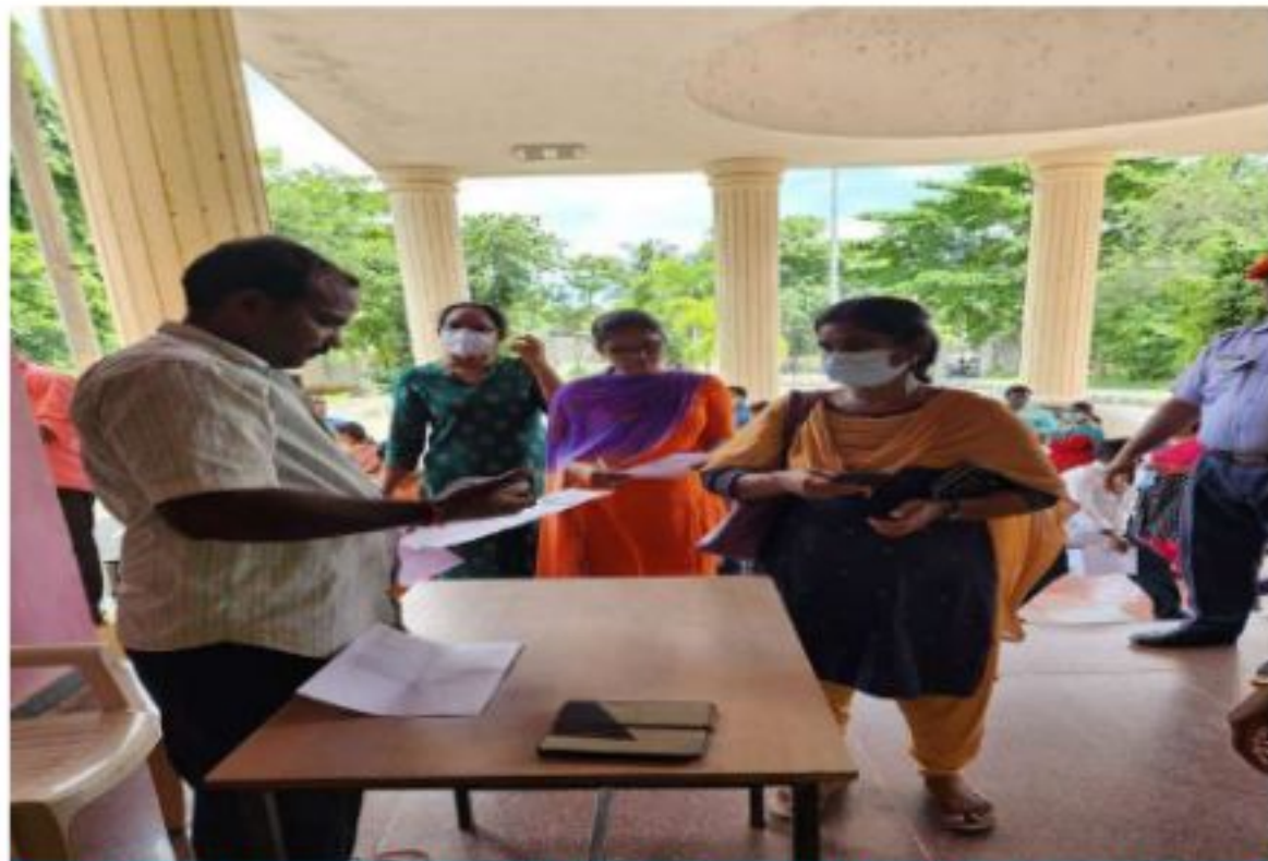
ASSISTANT MEDICAL OFFICER (AYURVEDA, SIDDHA, YOGA&NATUROPATHY, UNANI) EXAMINATION CONDUCTED ON 23.3.2025 HALL TICKET VERIFICATION