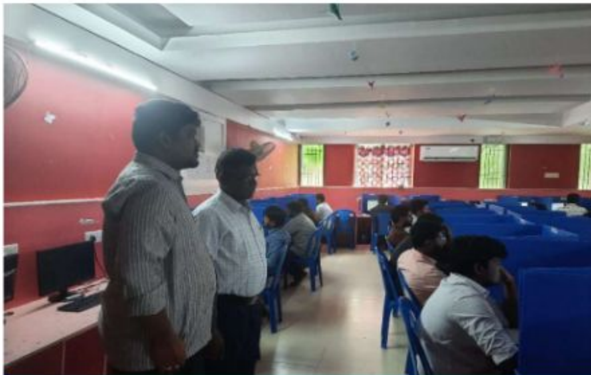
ASSISTANT SURGEON (GENERAL) EXAMINATION CONDUCTED ON 5.1.2025 MONITOR OF EXAM CENTER