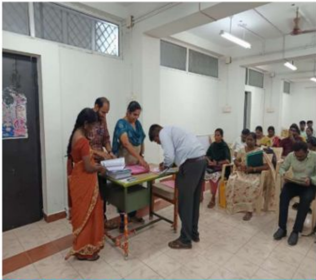
CERTIFICATE VERIFICATION CONDUCTED ON 1.9.2025 SENIOR ANALYST PHASE - II